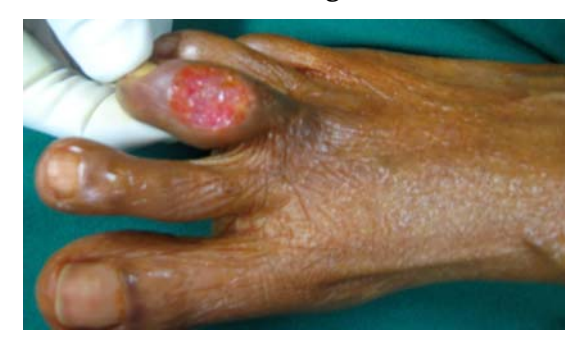
Fig 1: Chronic non healing ulcer dorsum of third toe – right foot

were administered based on culture and sensitivity reports by her family physician. There was no history of fever but she had loss of appetite and loss of about 3 kgs of weight in a period of six months. Physical examination revealed an ulcer of 1cm diameter overlying the dorsum of third toe of her right foot. (Fig 1) Interphalangeal joint movements were restricted and painful. There was surrounding oedema. Dorsalis pedis and posterior tibial artery pulsations were well felt bilaterally. There was no regional lymphadenopathy. The chest and abdomen were clinically normal. Plain radiograph of right foot which was done one month after trauma was found to be normal. Six months later it revealed cortical erosion of middle phalanx of third toe with osteoporosis of distal and proximal phalanges. (Fig 2) A diagnosisof post traumatic non healing ulcer due to chronic osteomyelitis was